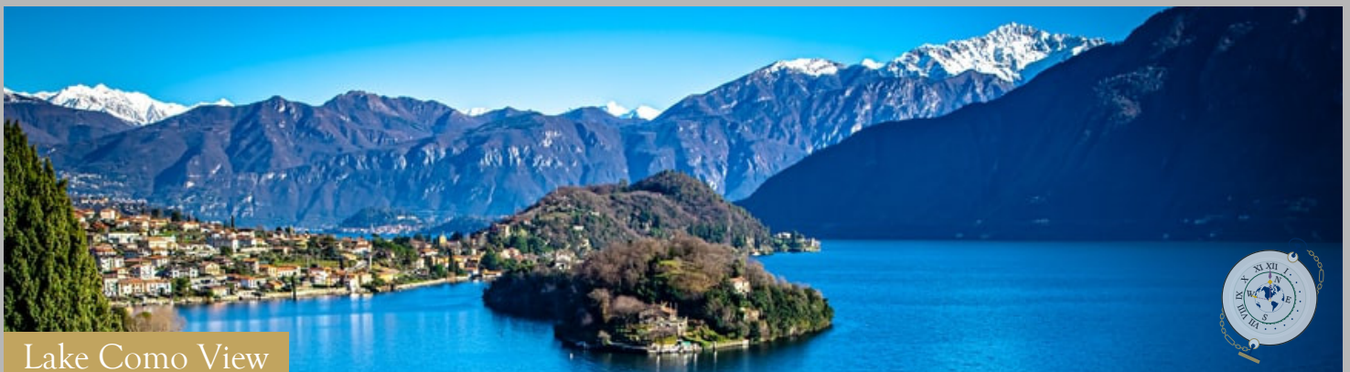
Lake Como View