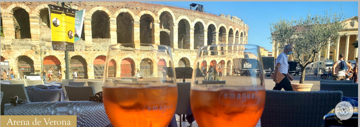
Arena de Verona

In the afternoon, you will relax with a panoramic tour in the hilly area of Valpolicella , where the territory and climate guarantee the success of excellent wines, famous all over the world. It is therefore a must to stop and visit a renowned winery to taste Amarone and Recioto .