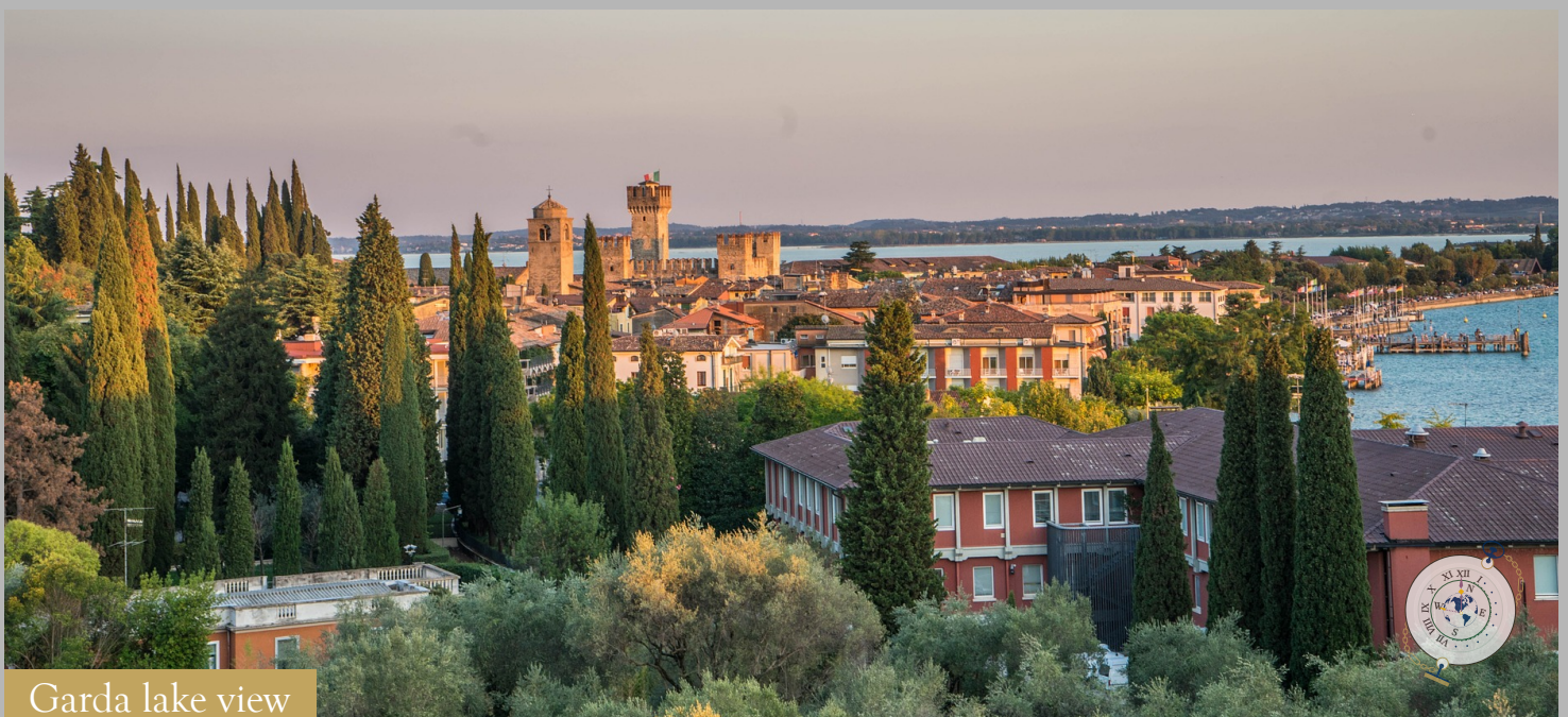
Garda lake view

4 nights' accommodation in 4* Superior Hotel Ocelle Thermae & SPA at Sirmione, Lake Garda .