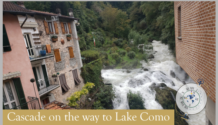
Cascade on the way to Lake Como