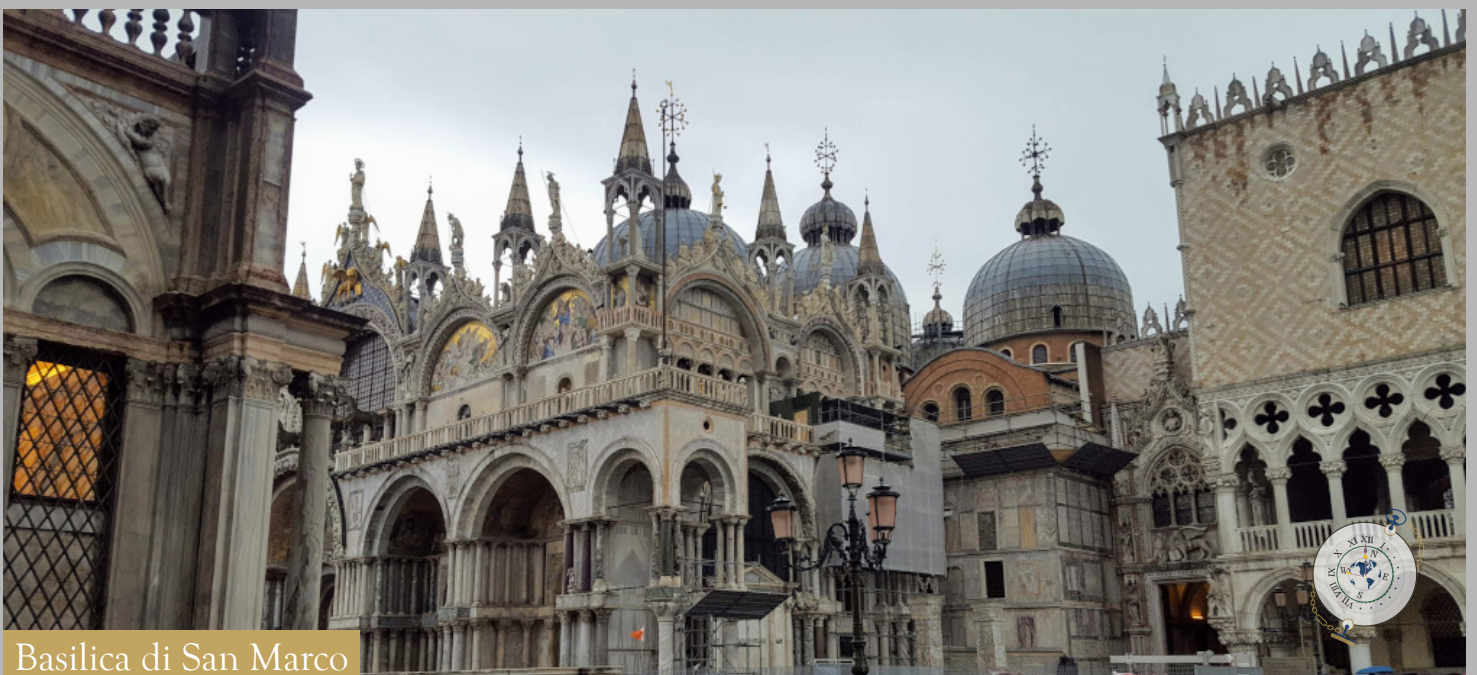
Basilica di San Marco

You indeed are going to have the local experience here.